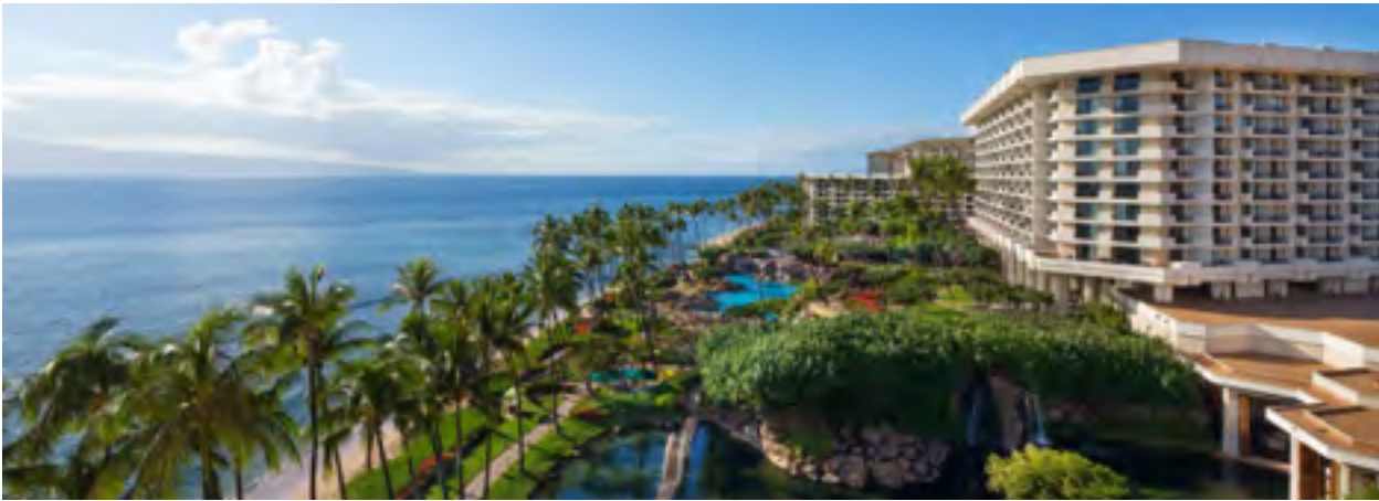
WIC 2018 | May 1-4, 2018 | Hyatt Regency Maui | Maui, Hawaii