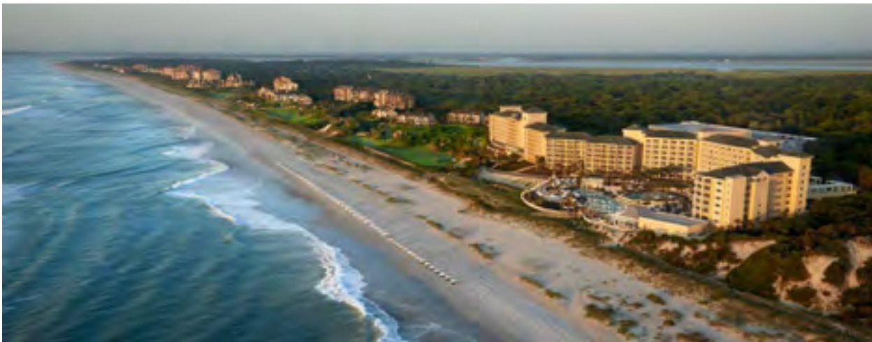
WIC 2019 | April 2-5, 2019 | Omni Amelia Island Plantation | Amelia Island, Florida